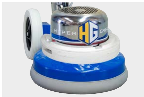
Dedicated weights for heavy use (optional).