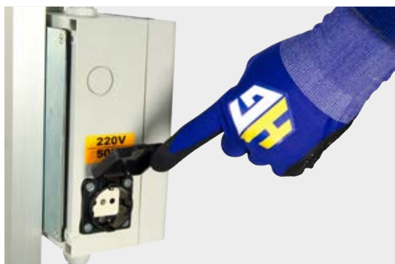
Additional 220V socket.