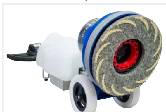
With the pad holder 17" uses all the Abrasive pads and the SPIRAL 17" diamond pads.