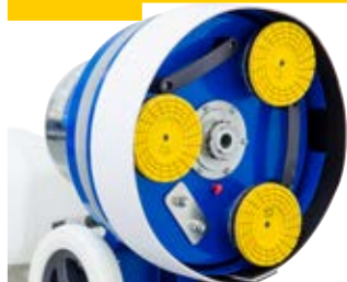
Pad Holder PADS