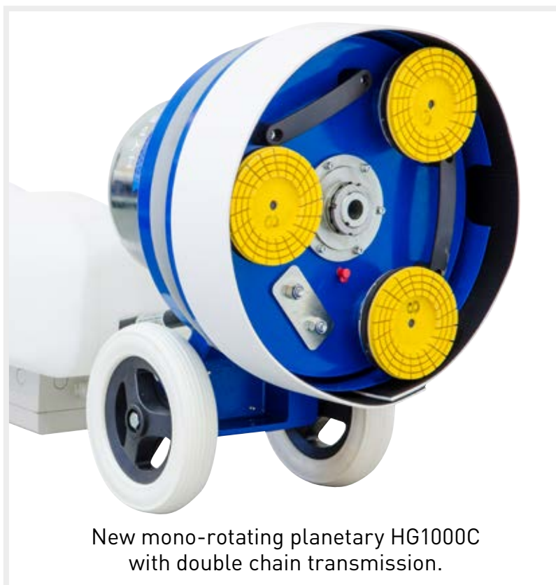
New mono-rotating planetary HG1000C with double chain transmission.