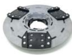
Spiral diamond pads