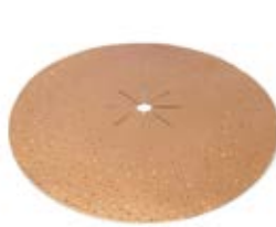
Plate with 3 Satellit