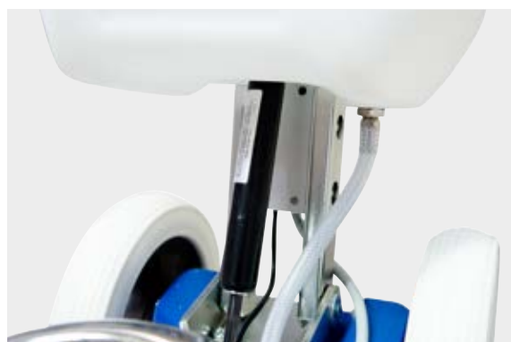
Micro-metric handle adjustment system (optional).