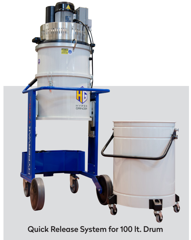
Quick Release System for 100 lt. Drum