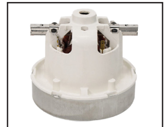
THRU-FLOW MOTORS WITH THERMAL PROTECTION