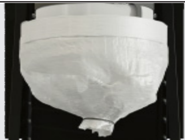
Collection system with continuous Bag